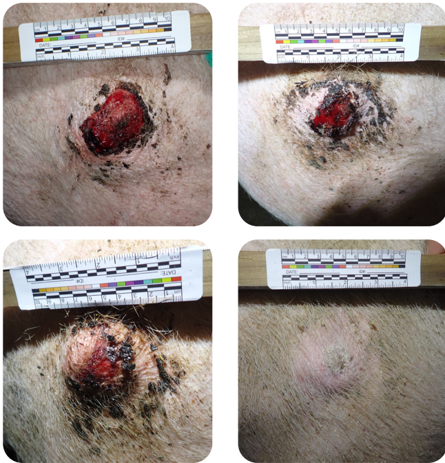
Photo series of chronic shoulder wound in a pig.